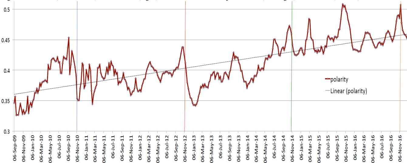
Figure 2: Weekly hashtag polarization. The four vertical lines indicate the 2010 midterm, the 2012 presidential, the 2014 midterm, and the 2016 presidential elections.

Bakshy, E., et al. 2015. Exposure to ideologically diverse news and opinion on facebook. Science 348(6239):1130–1132.